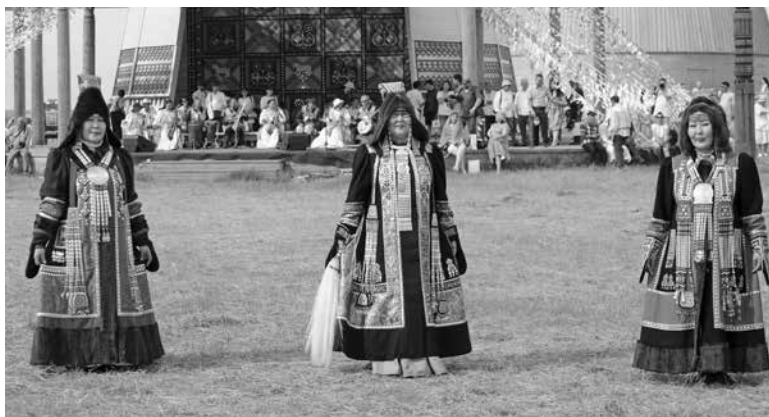
Fig. 4 Traditional Sakha costumes at the ysyakh festival, 2017.