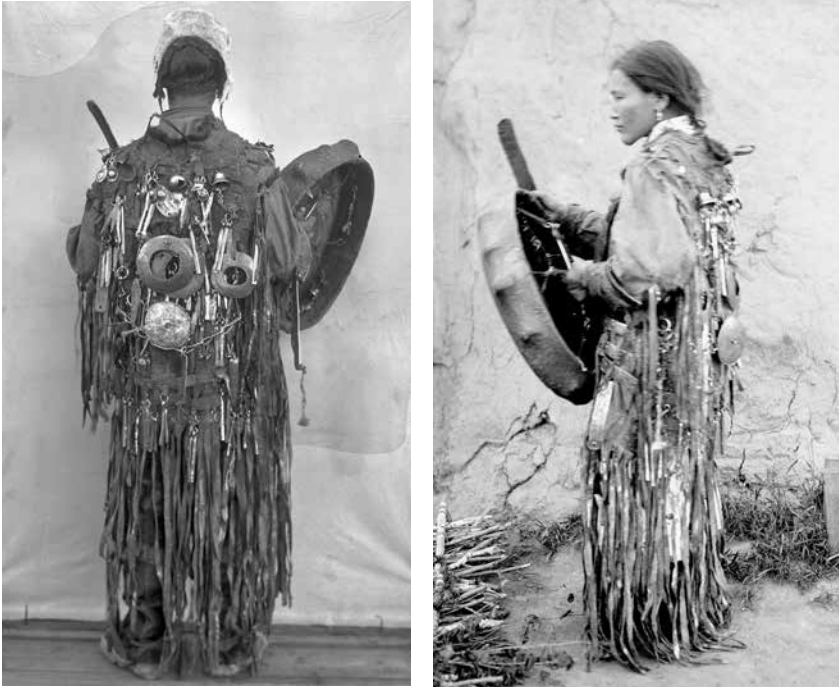
Fig. 1, 2 Yakut (Sakha) shaman woman in ceremonial dress, 1902.