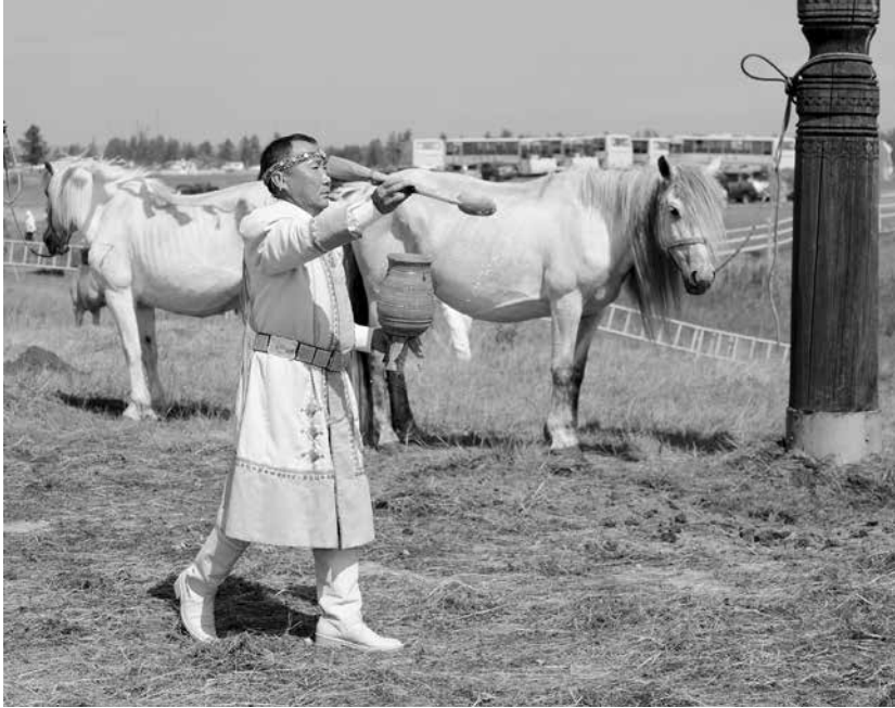
Fig. 6 A ritual of feeding the spirits of the land, 2017.