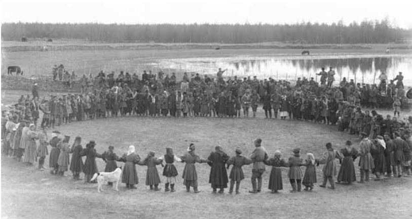
Fig. 8 Yakut dancing at ysyakh festival, 1902.