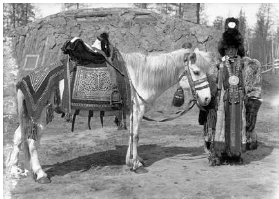
Fig. 3 Yakut bride of prosperous family, 1902. Image #1773.

The subsection Clothing contains detailed descriptions of types of dresses, costumes and footwear, well supplemented with drawings and photographs. The section conspicuously lacks descriptions and analysis of the decorative embroidery work which appears in the section on ysyakh , written earlier as a separate paper and entitled The Kumiss Festivals .