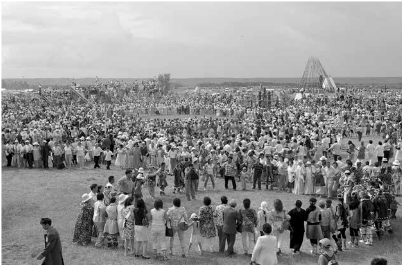
Fig. 9 Osuokhai , a circle dance, brings many people together and can last for hours, 2007.