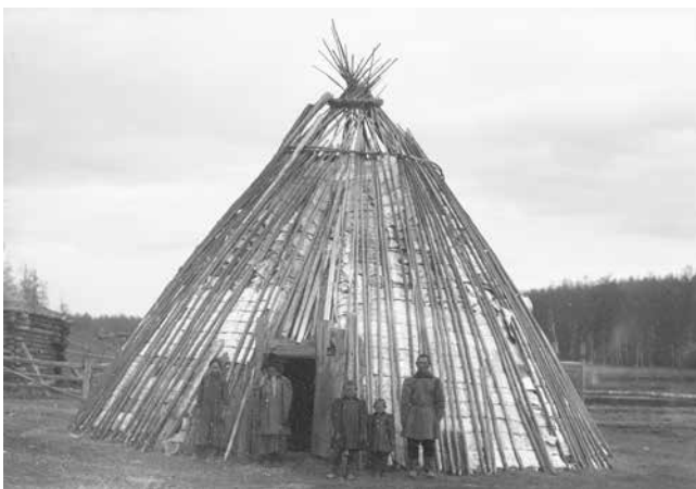
Fig. 10 Yakut family and summer house, 1902. Image #1768.

"The large ornamented wooden kumiss goblets described below are not easily obtained at present. The conical birchbark summer dwelling is no longer used", Jochelson wrote at the opening of the section predicting a decline of the Yakut culture (Jochelson 1933:197). This prediction was to warn about changes in the traditional