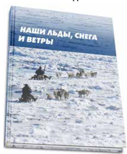
Fig. 1 Cover of the Russian SIKU book, Our Ice, Snow and Winds (2013)

This paper explores the story of the Russian SIKU ('Sea Ice Knowledge and Use')<sup>2</sup> project, a local component of the international effort in knowledge documentation and co-production during the recent International Polar Year (IPY) 2007–2008. SIKU project activities in other Arctic areas in Alaska, Canada, and Greenland were covered extensively in scores of international publications (cf. Krupnik et al. 2010a; Aporta 2011; Gearheard et al. 2013). Yet it was not until late 2013 that the full account of the Russian SIKU appeared in Russian, in the book called Our Ice, Snow and Winds