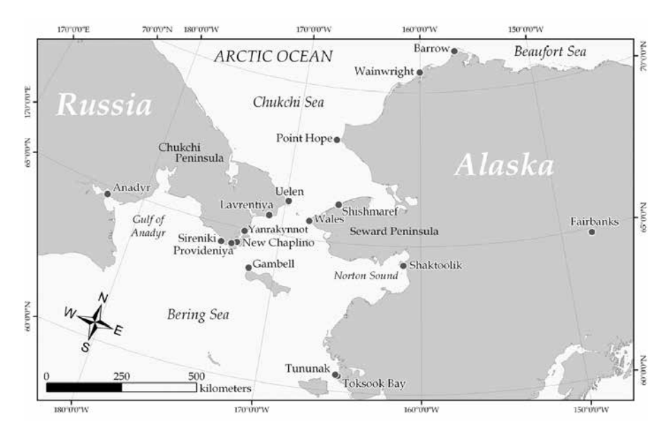
Fig. 2 Map of the Russian SIKU area (by Matt Druckenmiller)

Russian SIKU embraced the ethics and general approach shared by other SIKU activities in Alaska, Canada, and Greenland (Krupnik et al. 2010b: 7–14). It initiated monitoring of ice and weather conditions by local village observers; compilation of indigenous terminologies for ice, snow, winds, and weather-related phenomena; and documentation of elders and hunters' narratives related to the use of sea ice, safety in ice hunting and traveling, and practices of ice- and weather forecasting. Unlike most other SIKU efforts in North America, the Russian team engaged professional climate scientists, ice and weather monitors, and marine biologists. It explored ways to match instrumental ("scientific") data on ice, climate, and marine animals with indigenous observations and ecological knowledge. Thus, the story of the Russian SIKU illuminates many transitions in partnering, sharing, and building relations with northern communities that were critical to knowledge co-production as its eventual outcome.